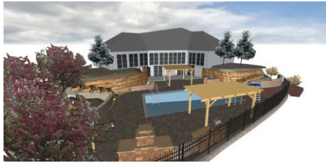
3D- Realistic Plan