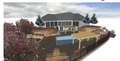
Photo Realistic Design