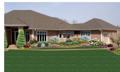
Photo Realistic Design