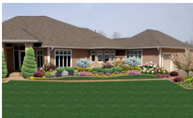
Photo Realistic Design